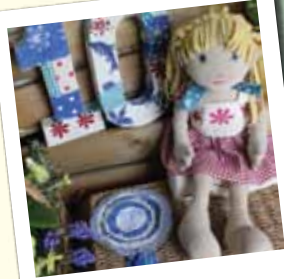
Ideas for Reuse

Can't compost then you can re-use any of the paper products by shredding them. soaking them and pressing them into a paper brick which you can then, with my compliments, burn on the fire to keep warm!